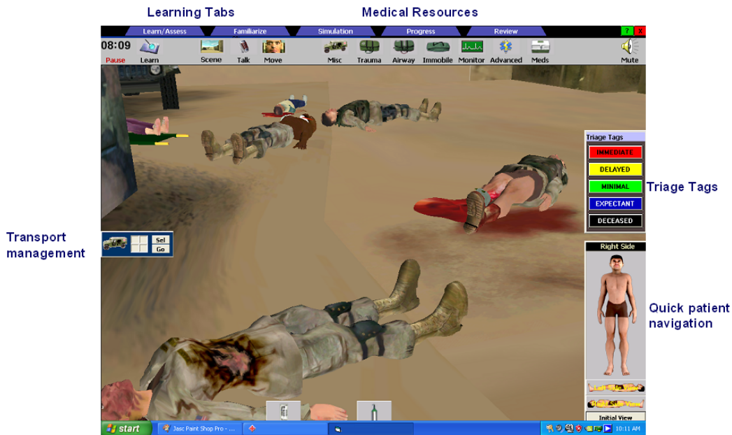
Figure 3. Multiple-casualty triage in the 3D interactive training environment.